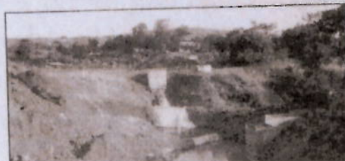
The Umgeni Water pipeline construction site in the Slangspruit where two boys drowned.